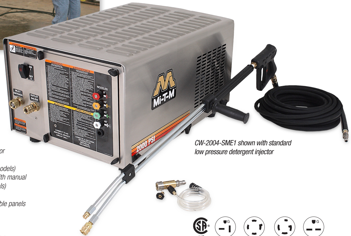
CW-2004-SME1 shown with standard low pressure detergent injector