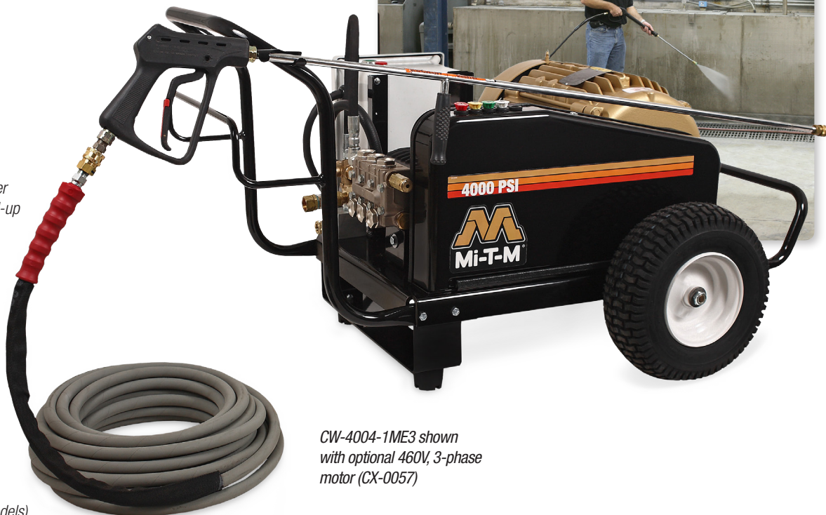
CW-4004-1ME3 shown with optional 460V, 3-phase motor (CX-0057)